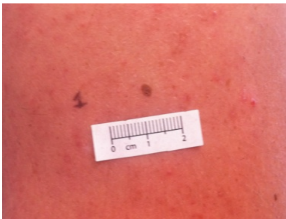
Figure 1 – iPhone 4 photo of skin lesion